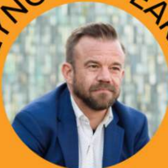
Mark Black Unbeatable Resilience