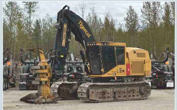
2018 TIGERCAT 855E FELLER BUNCHER