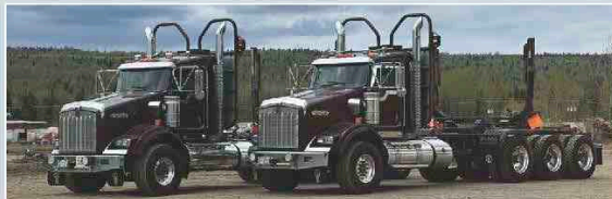
2 — 2017 KENWORTH T800 TRI DRIVE LOGGING TRUCKS