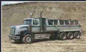
2017 WESTERN STAR 4900SB TRI DRIVE DUMP TRACTOR