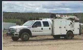
2014 FORD F-550 XLT CREW CAB SERVICE TRUCK