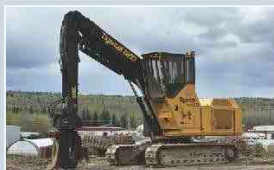
2017 TIGERCAT 880D LOG LOADER