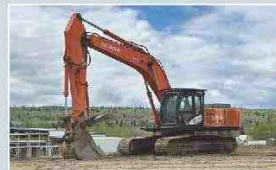
2012 HITACHI ZX350LC-5N HYD. EXCAVATOR