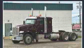
2016 PETERBILT 567 T/A SLEEPER TRUCK

CONSIGN YOUR EQUIPMENT! Contact a Sales Representative!