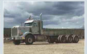
1 of 4 — 2019 PETERBILT 367 CAB & CHASSIS