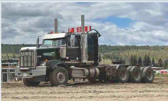
2019 WESTERN STAR 4900SB TRI DRIVE SLEEPER TRUCK