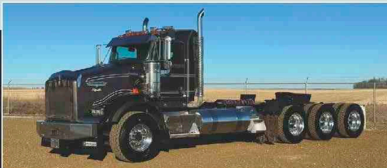
2018 KENWORTH T800 TRI DRIVE TRUCK TRACTOR