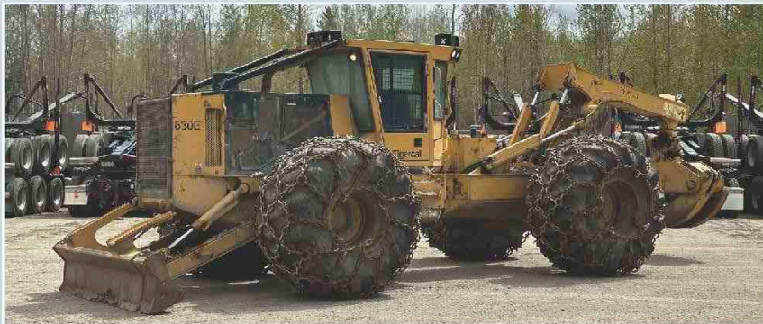
2015 TIGERCAT 630E 4X4 GRAPPLE SKIDDER