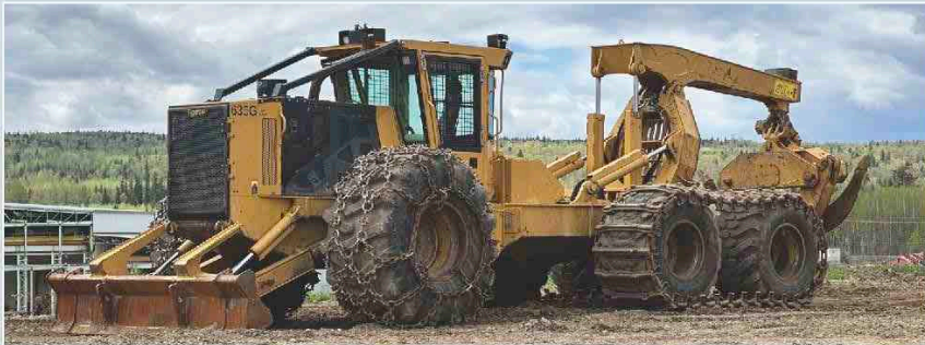
2019 TIGERCAT 635G 6X6 GRAPPLE SKIDDER